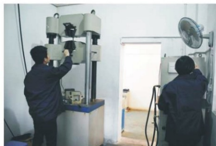
4、机械性能试验 Mechanical Test