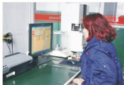
3、碳硫分析仪 Carbon and Sulfur Analyzer