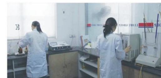
11、化学分析 Chemical Analysis