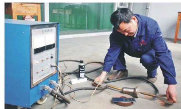
7、MT检测仪 MT Detector

Quality is Represented by the Incomparable Reliability and Performance of Products. 品质表现在产品无与伦比的可靠性