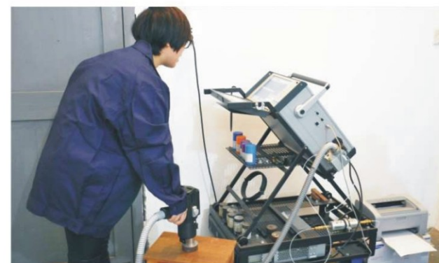
8、光谱仪 Mobile Spectrometer