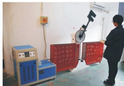
6、低温冲击 Low Temperature Impact Test

Quality is Represented by the Incomparable Reliability and Performance of Products. 品质表现在产品无与伦比的可靠性