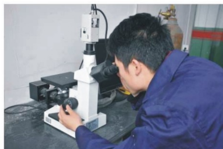
1、金相分析 Metallographic Analysis

Based on the conception of quality is the life of the enterprise and reputation is the base of the enterprise, our company establishes quality guarantee system to carry out whole-course quality control for the products. Luofu has a whole set of quality control procedures of its own. From the incoming of raw materials and outsourcing parts, the machining of parts to the outgoing quality control of finished production, the computer network management system is applied and product quality files are established so as to realize product traceability management. By insisting on the quality policy of customer centered to realize zero complaint of customers, based on system to seek for zero defect of products, we are pushing forward customer satisfactory project so as to satisfy customer demands and expects.