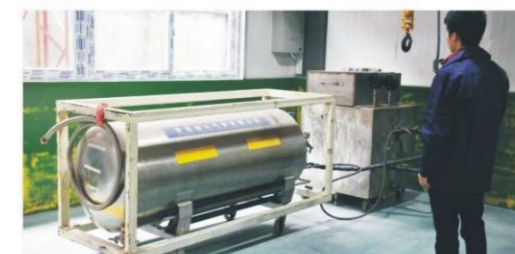
10、低温试验 Low Temperature Test