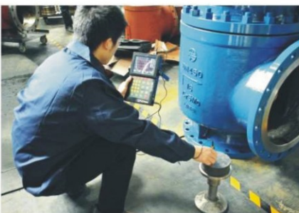
5、UT检测仪 UT Detector