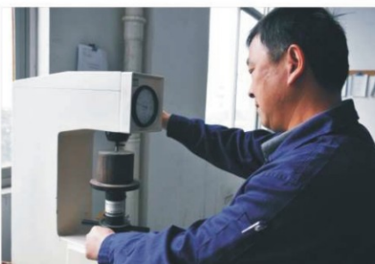
2、硬度仪 Hardness Tester