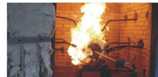
9、防火试验 Fire Test